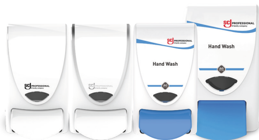
WHB1LDS DIS2127 WRM1LDS WRM2LDP