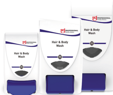
SHW1LDS SHW2LDP SHW4LDP